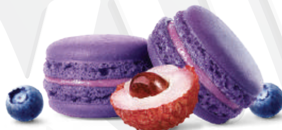
Lychee / Blueberry