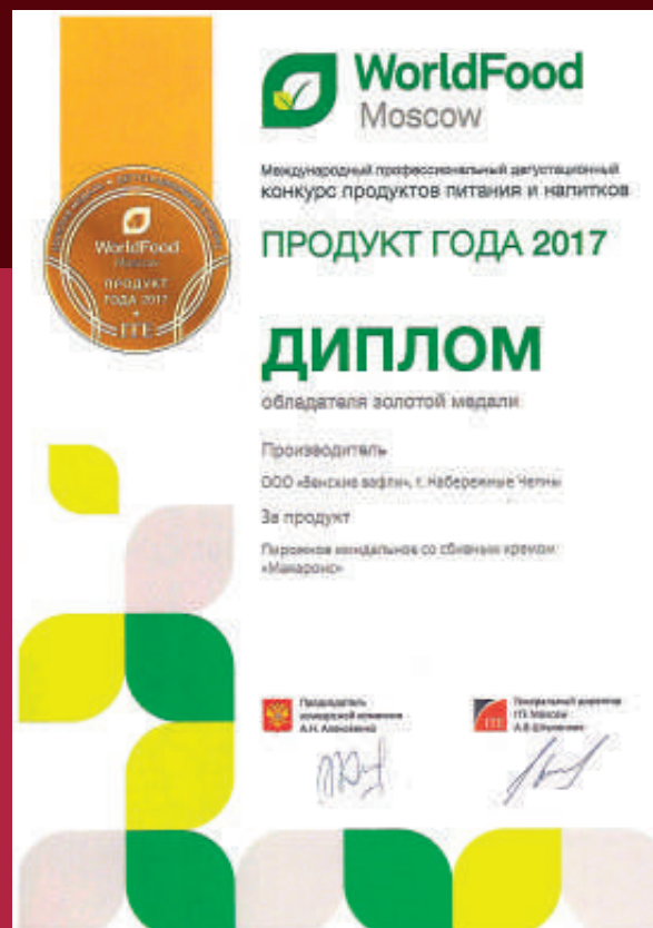
WORLD FOOD PRODUCT OF THE YEAR 2017