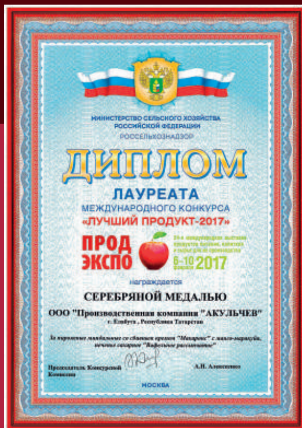
PROD EXPO BEST PRODUCT 2017