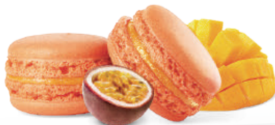
Mango / Passionfruit