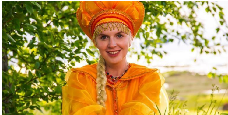
Fairy tale brand "Princess Cloudberry"