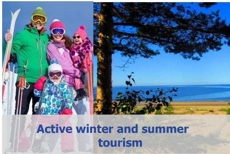
Active winter and summer tourism