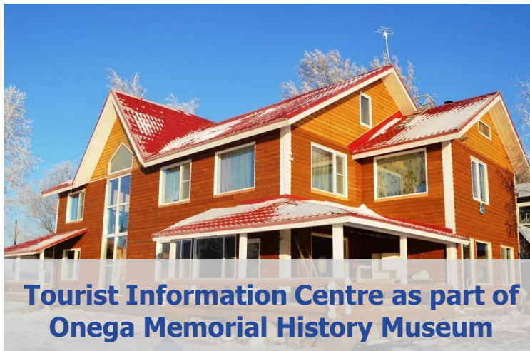
Tourist Information Centre as part of Onega Memorial History Museum