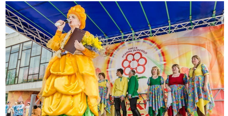
Festival "Orange-colored Summer, Cloudberry's Birthday"