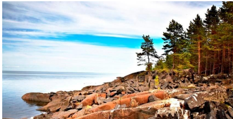
Kiy Island, a landmark of Onega Bay