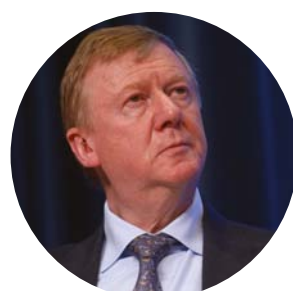
Chairman of the Executive Board of Rusnano Anatoly Chubais