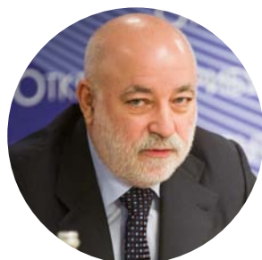
President of the Skolkovo Foundation Viktor Vekselberg