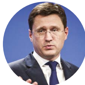
Minister of Energy of the Russian Federation Alexander Novak