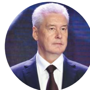
Mayor of Moscow Sergei Sobyanin