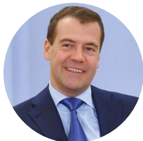
Prime Minister of the Russian Federation Dmitry Medvedev