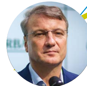
Chairman of the Executive Board of Sberbank of Russia German Gref