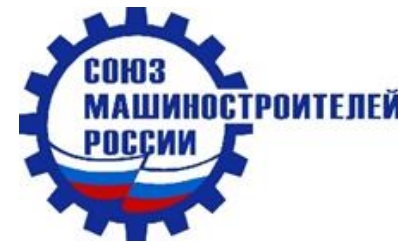
Russian Engineering Union