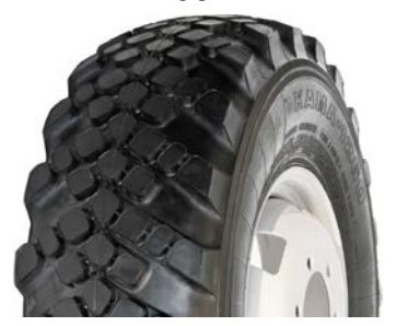
KAMA-1260-2 H.C. 14