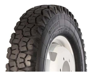
О-40БМ Н.С. 12