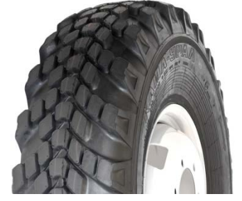
КАМА-УРАЛ Н.С. 18