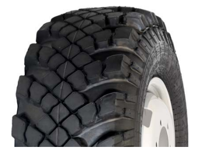
ИД-П284 Н.С. 10