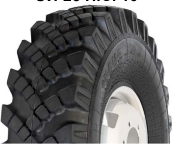
ОИ-25 Н.С. 10