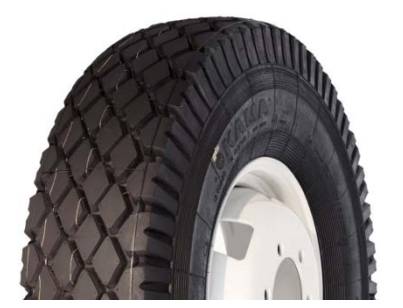
ИД-304 У-4 Н.С. 18