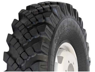
ОИ-25 Н.С. 14