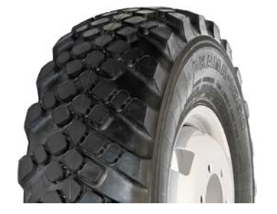
KAMA-1260-2 H.C. 18