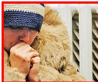
Heat loss defrosting pipes