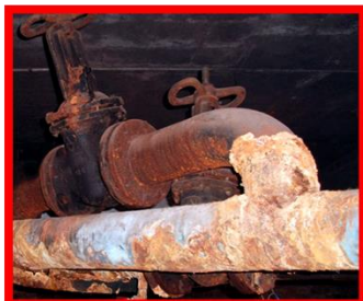
Global wear trubosistem High accident rate

A lot of work and time spend appropriate services to maintain the health of the huge thermal economy of the country is very large funds are spent on its content. Questions provide residents with heat is constantly monitored , but the situation does not improve, but rather worsens, an increasing percentage of networks and equipment depreciation , rising rates , deteriorating the quality of services , etc. And it is time to think about all that we can make mistakes in the strategic , technical terms ? We have confidence that if nothing changes , you can once again invest heavily in the rehabilitation of existing thermal farms , but also in 20 - 25years will be the same result , but on the subsequent recovery of funds will need to be three times more.