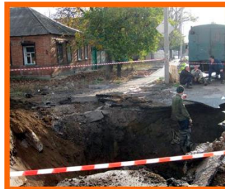
dangerous landslides soil and roads